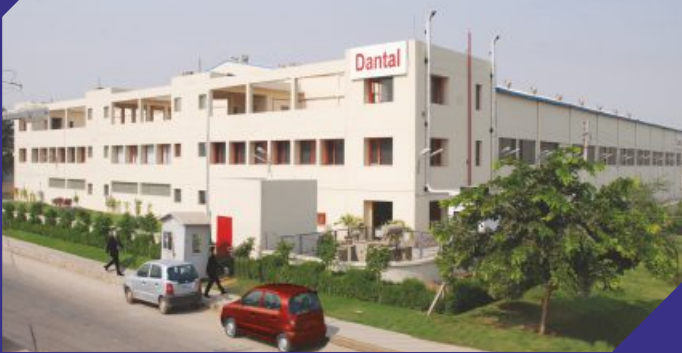
Manesar Works : Cylinders