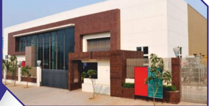
Manesar Works : Rod processing