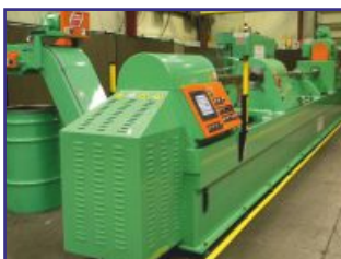
Skiving & Roller Burnishing