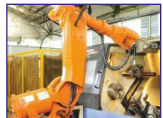
Robotic M/c loading Unloading