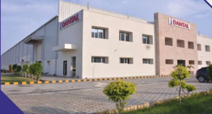
Ghiloth Works : Special Cylinders