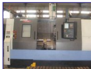
CNC Turning & Machining Centres